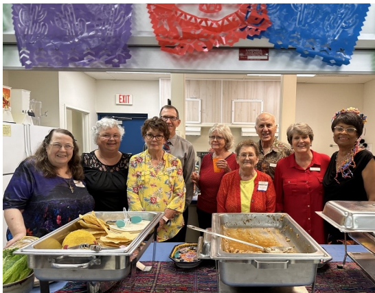
Our amazing kitchen volunteers!!