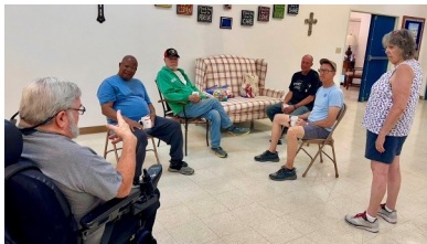
Taking a much needed break!