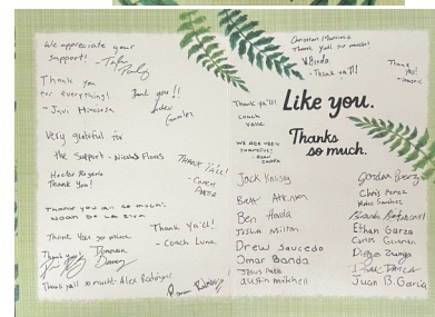
Thank you card from the team.