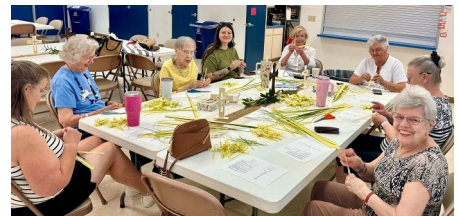
Crosses almost ready for Sunday!